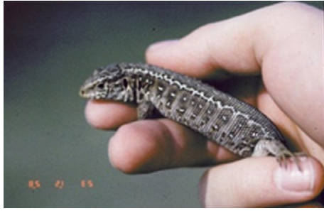
FIGURE 1 Female sand lizard ( Lacerta agilis )