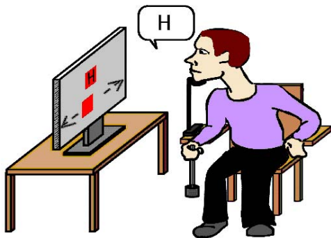
Figure 1. The experimental setting.

the non-tracking conditions so that direction change information was either available (under the left or right ends of the trajectory of the oscillating stimulus) or not (under the middle trajectory of the oscillating stimulus). A control condition in which letters appeared on a stationary square in the middle of the screen while an invisible oscillating stimulus oscillated back and forth was included to evaluate chance level entrainment. In addition, the oscillating square moved at three different frequencies, the subject's comfort mode period, this period + 5% (slower), and this period - 5% (faster). Trials were 40 s in length.