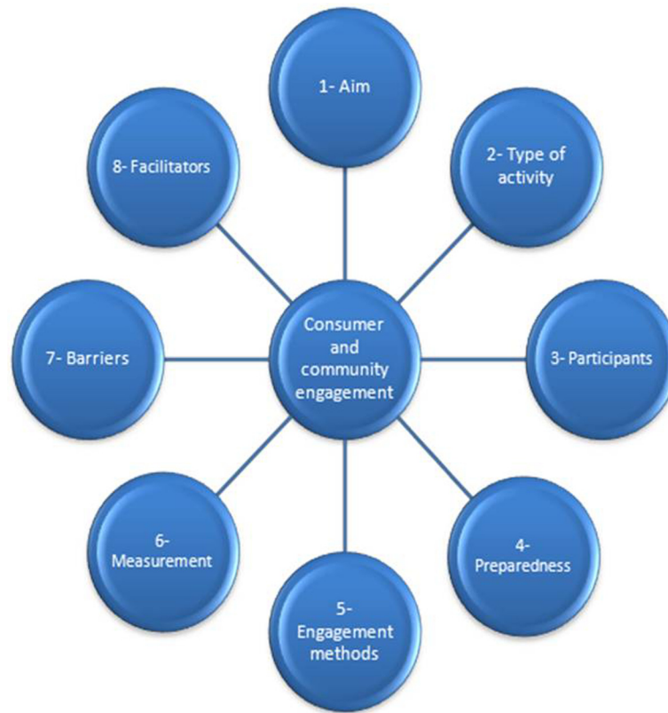
Figure 2 The eight stage model for implementation of CCE.

everything available, such as non-systematic reviews and grey literature. Therefore, we might have failed to capture activities and strategies that are not reflected in review papers. In addition, while we utilised an extensive list of 47 search phrases, we acknowledge that we are presenting a snapshot of this emerging field. It is necessary to continue reviewing related data through further reviews. Finally, we undertook a qualitative analysis of the included papers, an inevitably subjective process. Therefore, we recommend that future work examine the model we propose and attempt to refine it.