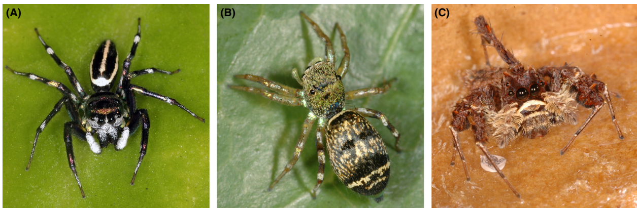
Figure 1. The color variation between study animals; (A) Male Cosmophasis umbratica ; (B) Female C. umbratica ; and (C) Male Portia labiata .

A potential cost of conspicuous coloration is that predators may eavesdrop on the signal (Bernal et al. 2006). The white-mustached jumping spider, Portia labiata , is a spider-hunting specialist and a natural predator of C. umbratica . Portia labiata , like C. umbratica and many other jumping spiders, can detect UV reflectance (Hu et al. 2012). Unlike C. umbratica , neither sex of P. labiata is colorful (Fig. 1C) (Jackson and Hallas 1986), hence their ability to discern UV is unlikely to be maintained by sexual selection. Instead, P. labiata 's sensitivity to UV appears to be important for foraging. Both P. labiata and C. umbratica forage among the leaves and stems of low-lying vegetation (Jackson and Hallas 1986; Lim and Li 2007). Such environments are UV absorbing, so UV reflectance will stand out from the background. They have been shown to cue in on UV-reflecting silk when locating web-building spiders (Li and Lim 2005; Zou et al. 2011). Silk reflects no color in the visible spectrum, and so its detection is unambiguously via its capacity to