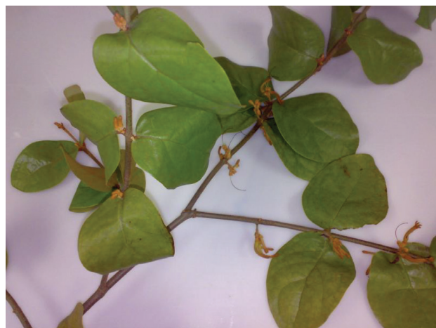
Figure 1 Loranthus ferrugineus Roxb.

Slenders of the bush, young parts, are described to be inflorescences [54]. Branches and twigs of the herb are long, pendulous, and densely clothed with L. ferrugineus down when young, in addition to the underside of the leaves, pedicels, calyxes, and corollas. The rusty colored leaves are opposite in direction, positioned on short petioles, elliptic, obtuse, coriaceous, and glabrous above [55]. These leaves are elliptic, with 4 - 8 cm long inder surfaces densely cov-