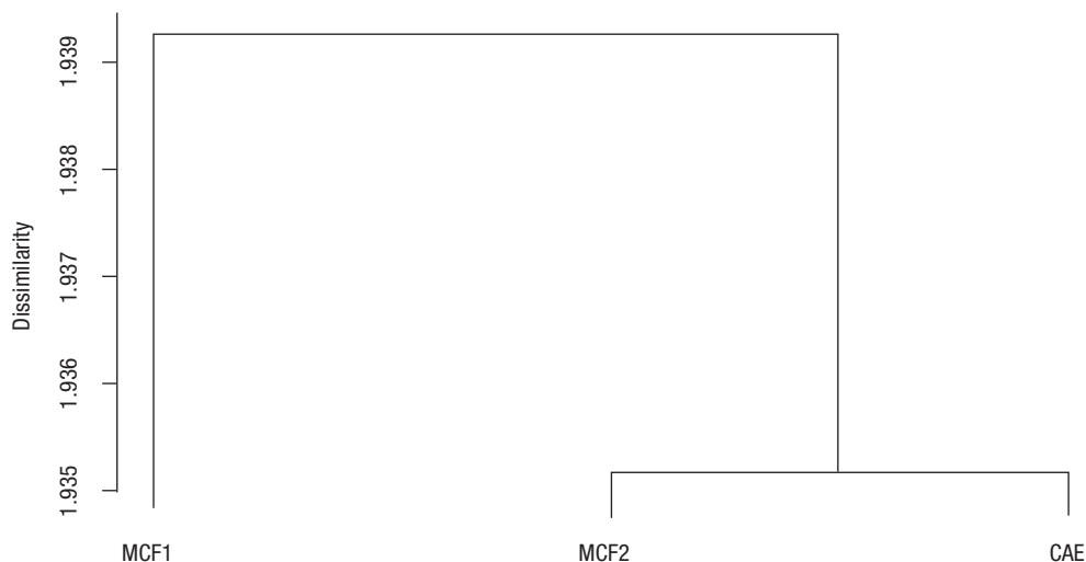
Figure 2. Cluster analysis showing the relationships among our study sites: undisturbed montane cloud forest (MCF1), perturbed montane cloud forest (MCF2), and coffee agro-ecosystem (CAE) within the coffee region of Coatepec-Xico located in the central highlands in the state of Veracruz, Mexico.

Another important finding is the high dissimilarity between MCF1 and MCF2, where the low number of species in MCF2 shows the shocking biodiversity loss in perturbed areas. Although ecosystems such as MCF2, are subject to influences determined by other species (e.g. predators, competitors, invaders), and temporal and spatial variations of environmental conditions, such as nutrient availability, temperature and precipitation (Chapin et al. , 2000; Bellemare et al. , 2002), human activities and perturbations have a great impact on them. Human perturbations can decrease local diversity or richness, as it was seen in MCF2; however, for CAE this is not necessarily true. Human perturbations can widely change floristic composition of ecosystems, but agroforestry can help to mitigate