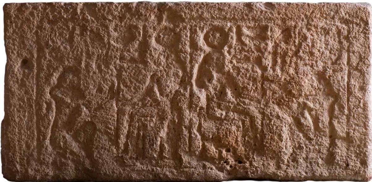
Figure 12.6: Stone lintel from Byblos depicting the goddess Hathor 'Lady of Byblos' with a kneeling king, possibly Pepi I, 6th Dynasty. DGA 2028 © Ministry of Culture, Lebanon/Directorate General of Antiquities. Drawing after Montet 1928a, fig. 6.

access to which was a sign of royal favour and capable of improving one's status in the present and in the afterlife.