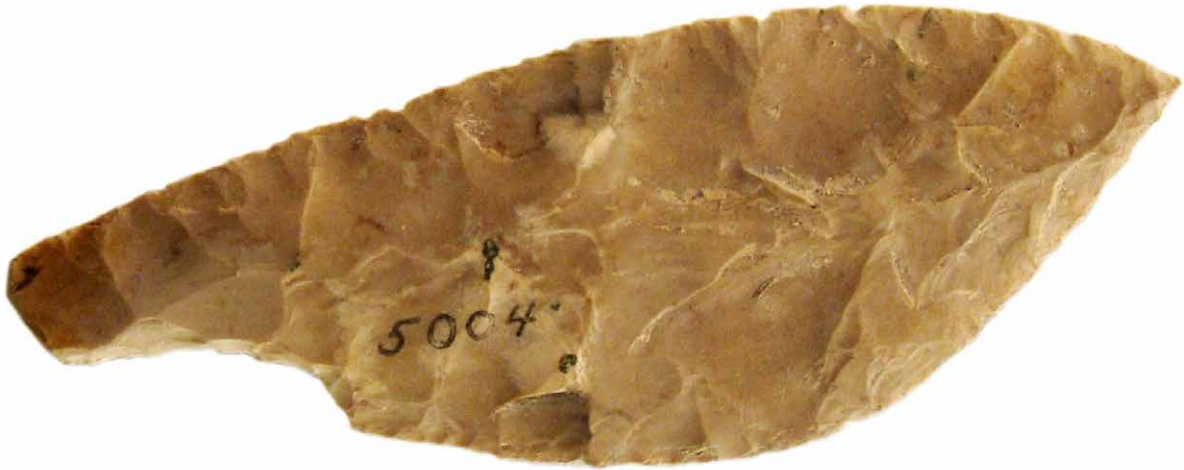
Figure 12.7: Egyptian flint knife from Byblos, Old Kingdom, c. 2613-2181 BC. Inv. 5004