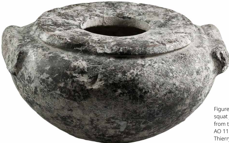
Figure 12.2: Unscripted diorite squat jar, 2nd-3rd Dynasty, from the Baalat Gebal Temple. AO 11067 © Louvre Museum / Thierry Olivier.

Imported ceramic jars found in Tomb U-j at Abydos in southern Egypt dating to c. 3320 BC provide further evidence of Lebanese connections. Belonging to an early local ruler, the tomb was richly furnished with hundreds of imported vessels, used as containers for liquid commodities, notably wine. This astonishing number reveals the scope and reach of early Egyptian elite acquisition of raw materials, manufactured items and liquid commodities. The tomb also included imported obsidian, lapis lazuli, a box made from Lebanese cedar and foodstuffs. Ceramic analysis exposed a wide range of Levantine manufacturing centres,