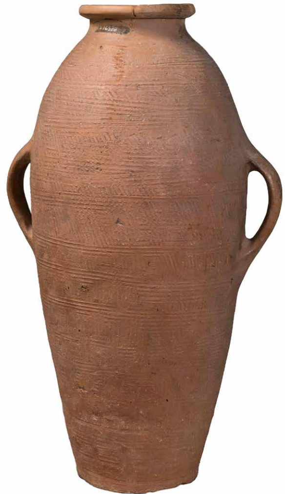
Figure 12.8: Combed jar from Edfu, late 5th Dynasty-early 6th Dynasty, c. 2400 BC. E16577 © Louvre Museum / Maurice et Pierre Chazeville.

Crucial to the success of Byblos was its location, affording access to other regions such as Ugarit, the fertile Beqaa Valley, the Akkar Plain and the Syrian hinterland. Such routes extended the Egyptian ‘reach’ through direct and indirect access, into which Byblite elites were co-opted. Evidence is revealed by Egypt’s relations with the major north Syrian polity of Ebla (see Chapter 13). Many Egyptian