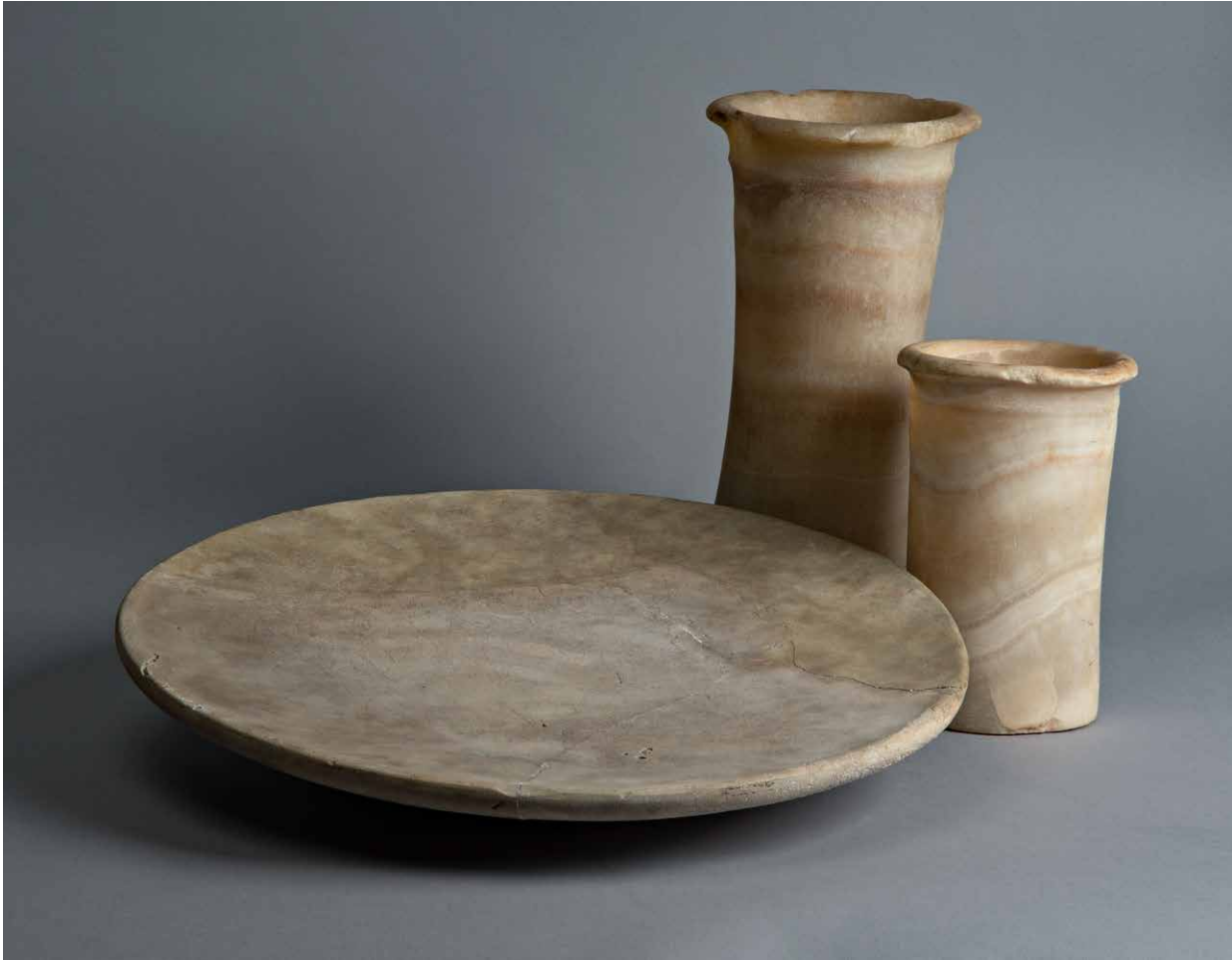
Figure 12.4: Complete examples found in Egypt of types found in and around the Baalat Gebal Temple. F 1926/6.5, AAL 112, AAL 114

a colony during this period was proposed and widely held. A cylinder seal with an inscription in hieroglyphs bearing the words keben , the name of the local deity, and the name of a Byblos ruler, suggested that it was carved by Egyptians for the local leader (Fig. 12.3; Montet 1928a, 62-81; Goedicke 1963). Many stone vessels, such as circular offering tables and jars (Fig. 12.4), types associated with cultic activity, were found in deposits in and around the Baalat Gebal Temple, implying Egyptian offerings to the local cult (Bevan 2007, 76-78). Importantly, did the Egyptians worship the local female deity and was it eventually conflated with the Egyptian goddess Hathor (Espinel 2002)? Over the decades, these questions have proved difficult to answer.