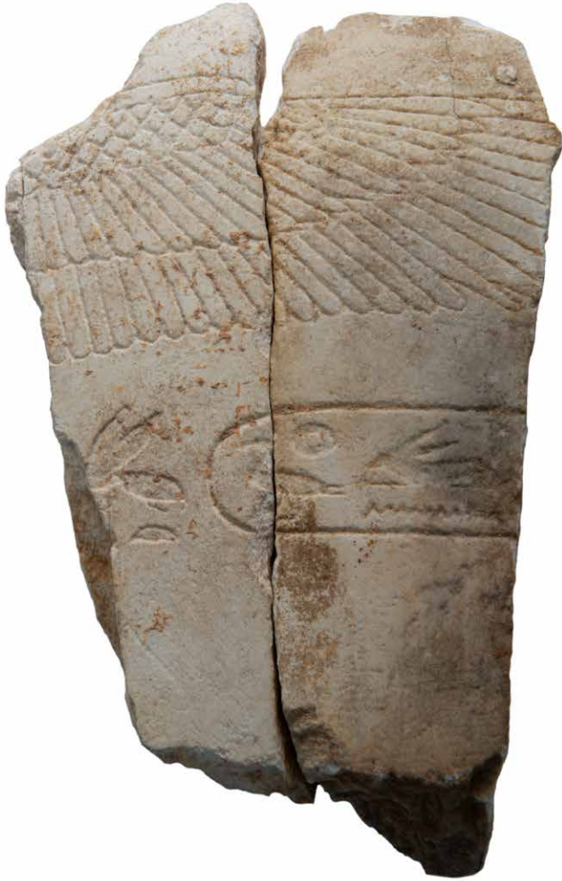
Figure 12.1: Fragment of a travertine jar from the Baalat Gebal Temple. The outstretched wing of a deity is carved onto the surface; the fragmentary text reads left to right '[king of Upper and] Lower Egypt, Son of Re, Un[as]', 5th Dynasty, date of reign c. 2375-2345 BC, scale 1:1. DGA 128405

juniper are not native to Egypt, but originate in the higher altitudes of Lebanon, Syria and Turkey.