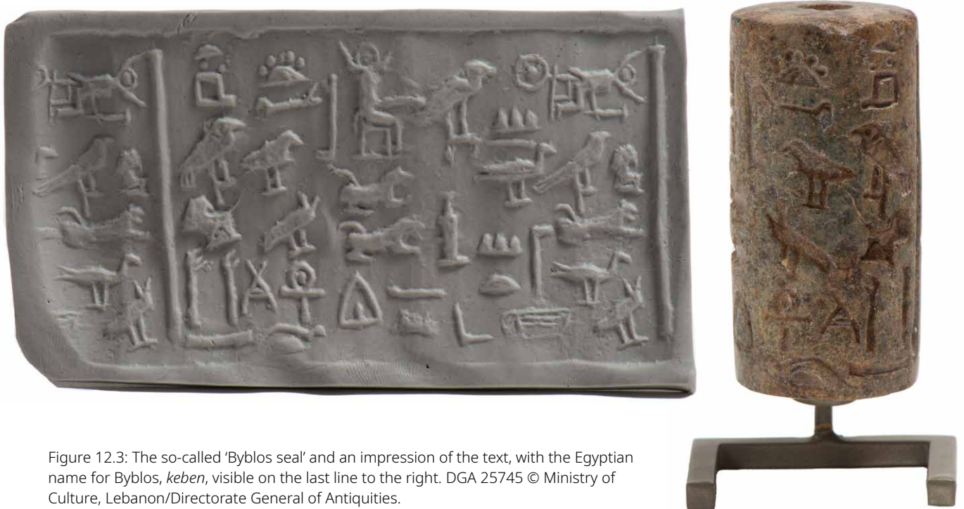
Figure 12.3: The so-called ‘Byblos seal’ and an impression of the text, with the Egyptian name for Byblos, keben , visible on the last line to the right. DGA 25745 © Ministry of Culture, Lebanon/Directorate General of Antiquities.

The stone vessels are regarded as diplomatic gifts, temple offerings and trade items, with the name of the king signifying a personal ‘calling card’ from the pharaoh himself (Bevan 2007, 70, 76-78). At the time, their discovery along with many other artefacts prompted intense speculation regarding the role of Egyptians at Byblos. Some other finds were architectural elements, suggesting Egyptian structures, or buildings with heavy Egyptian influences. Were they built by Egyptians resident at the site, or did it represent emulation of Egyptian cultural forms by Byblite elites? That the Egyptian state established a permanent presence or even