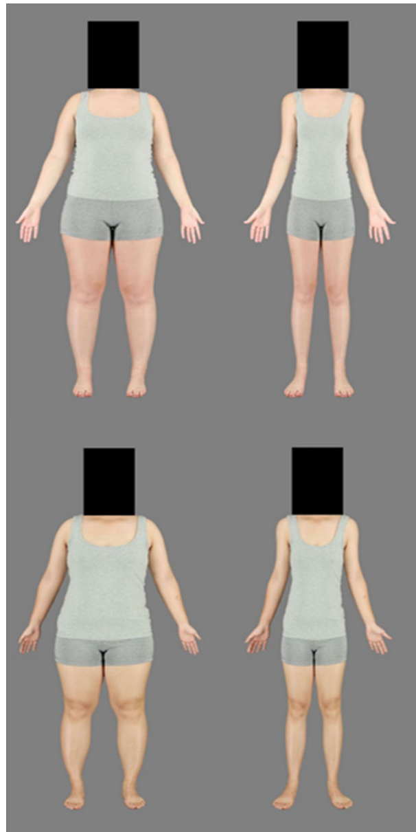
Figure 1. Example body stimuli depicting expanded (left) and contracted (right) versions of the same identities. Body stimuli on the top row are of a woman identifying as White Australian, while those on the bottom row are of a woman identifying as East Asian.

Here, 'L' refers to the left side of the screen, 'R' refers to the right side of the screen, 'P' refers to the probe and 'T' refers to the target stimulus (which for this study was the contracted body stimulus). For example, 'LPRT' refers to the mean response time when the probe (P) was located on the left (L) but the contracted body stimulus target (T) was located on the right (R) and so on. A positive attentional bias score represents a bias to contracted body stimuli while a negative attentional bias score represents a bias to expanded body stimuli.