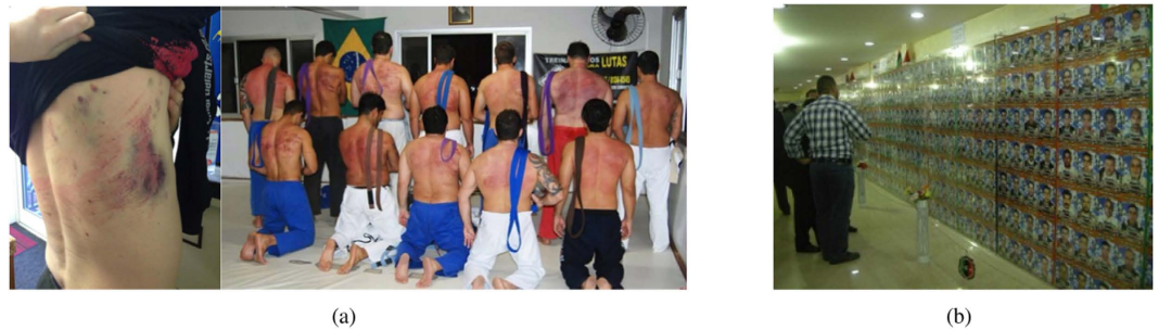
Figure 1. Shared dysphoric experiences. (a) Bruises and welts from Brazilian Jiu Jitsu belt whipping gauntlets. (b) Memorial in Misrata to the thousands of revolutionaries in Libya who laid down their lives in the 2011 uprising.

is a cause of extreme cooperation across cultures, in contrast with the less extreme forms of cooperation motivated by identification (alignment with a group category) and ethnic psychology (the acquisition, storage, and deployment of socially learned group identity markers) 22,24 .