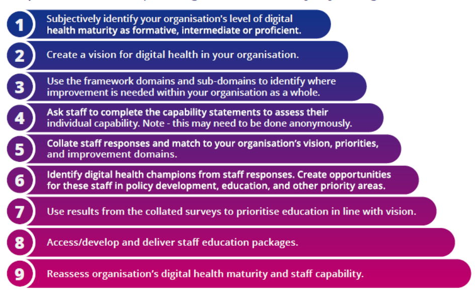
Figure 2. Use of the framework by an organisation.

Steps to assess and improve digital health maturity in your organisation