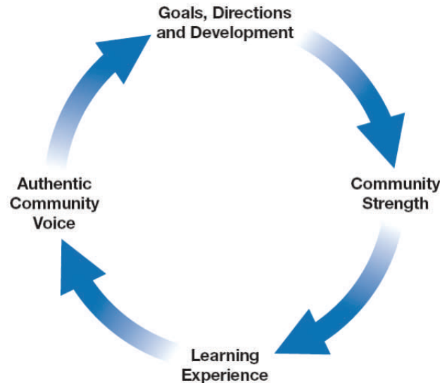
Figure 1: The community strength model (CSM)