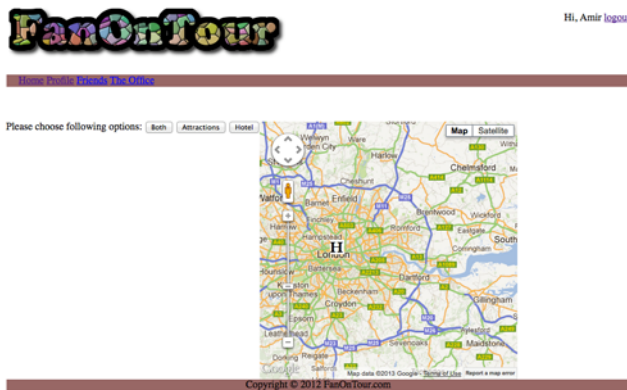
Fig. 5. Customized map shows the location of hotel