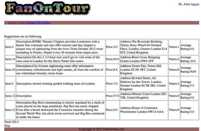
Fig. 3. The suggestions of FanOnTour

Comprehensiveness of the suggestions is based on the information provided in the search box and whether users have built their personal profile. Creating a profile is simple. They are just asked to provide their interests and dislikes. For example, if someone is interested in Sports, sport related activities would be in high importance for the application. On the contrary, if someone has added sports to his/her dislike list, sport related activities would not be provided in the suggestions. Figure 3 shows a list of suggestions.