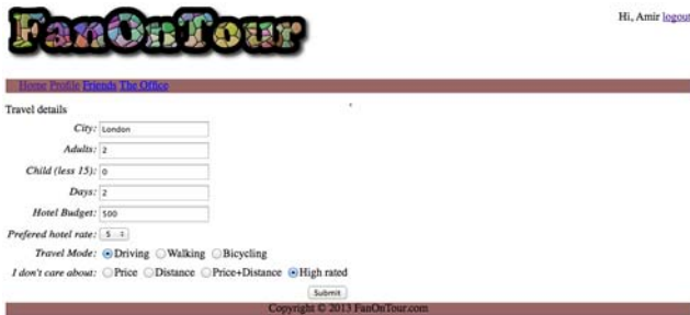
Fig. 2. Travel Details

To validate the solution a system prototype has been designed and implemented. Figure 2 demonstrates the landing page of the prototype. Users may use the provided search box to search for the suggestions; most parts are the same as other Travel Advisor websites, except for the last two parts that ask for "Travel Mode" and "Type of Considerations". By choosing any option of "Travel Mode" users would provide their main mean of transportation. Calculation of travel destination and durations will be based on this section.