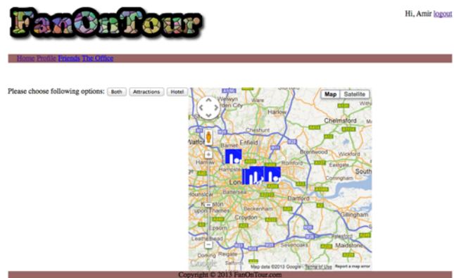
Fig. 4. Customized map shows the location of suggestions

As shown in figure 3 the total amount of traveling is provided at the end of the table, as the user has chosen "High Rated" option in the search box, the application ignores the prices and provides an expensive list of suggestions.