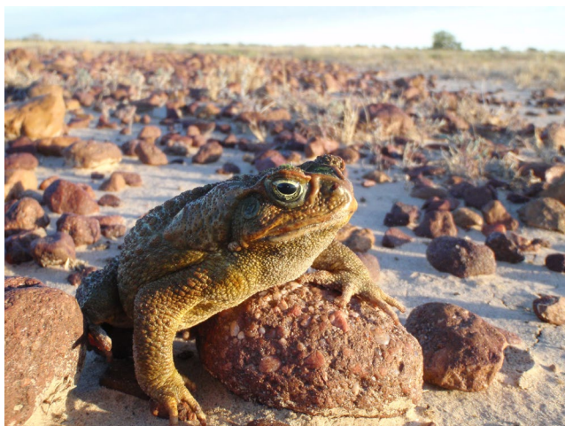
FIGURE 1 Adult cane toad, Rhinella marina , in arid habitat near Longreach, Queensland.

Cane toads are large “true toads” (family Bufonidae) native to an extensive area of South America (Bessa-Silva et al., 2020; Zug & Zug, 1979), occurring in a variety of habitats including grassland, woodland, sand dunes, rainforest, mangroves, and anthropogenically disturbed areas. Whereas the dorsal skin is tough and leatherlike, the smoother ventral skin (especially the highly permeable pelvic patch) is responsible for most of the organism's water uptake (Parsons et al., 1993). The species' Latin name Rhinella marina , and one of its common names—the marine toad—come from its putative resistance to higher levels of salinity than are tolerated by most