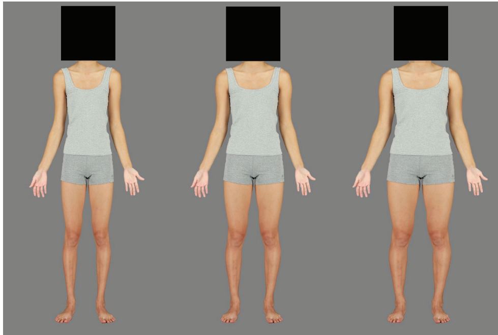
FIGURE 2 | Original (center) and contracted (left) and expanded (right) endpoints of the manipulation used to produce the test stimuli. All faces were visible during experimentation.