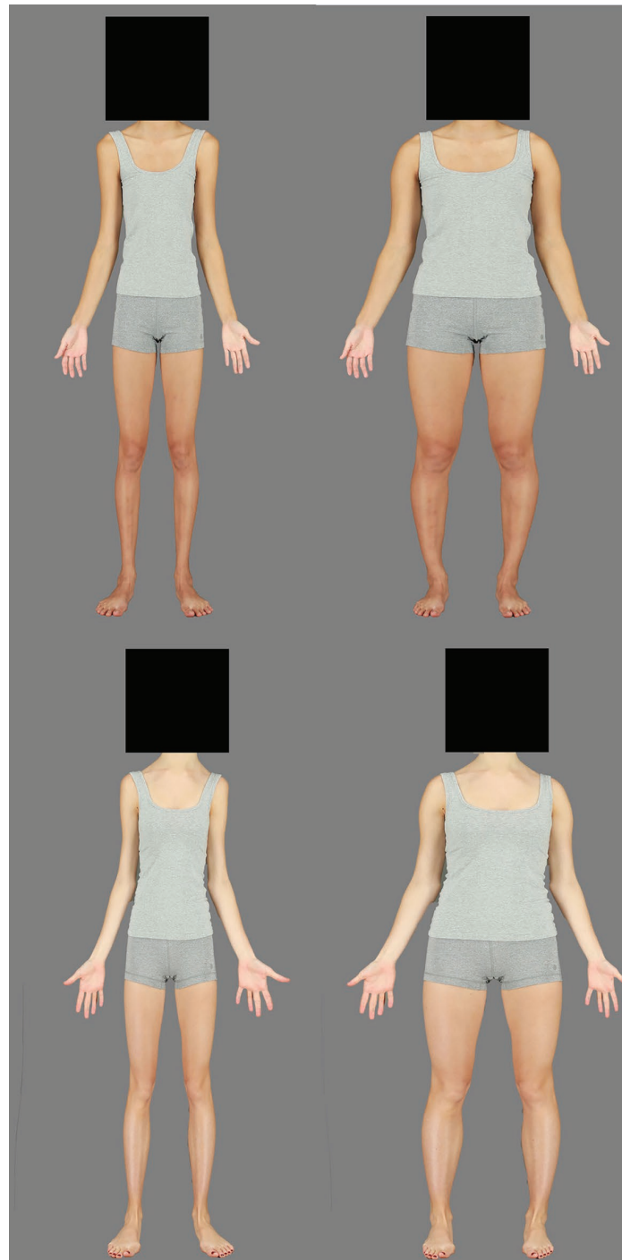
FIGURE 1 | Examples of Asian (top) and Caucasian (bottom), contracted (left) and expanded (right) adaptation stimuli, matched on initial BMI. All faces were visible during experimentation.

Each identity was presented six times, for a total duration of 12 s. Participants were not required to make a response, and no beep sound was played. Following this initial adaptation, participants were presented with the same 20 test identities from the baseline phase (10 Asian and 10 Caucasian, matched on initial BMI), once each, one at a time, in random order,