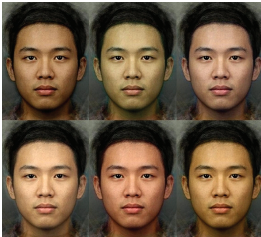
FIGURE 1 | CIE Lab color transformation of a face with decreased (top) and increased (bottom) lightness ( L^* , left); redness ( a^* , middle); and yellowness ( b^* , right). Presented face is a composite for illustration purposes, but photographs of real individuals were used as the stimuli.